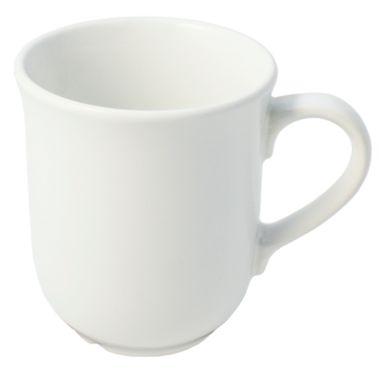
Capacity 280ml | Height 93mm | Diameter 80mm | Direct Print area 185 x 40mm | Transfer print area 215 x 50mm | Weight 240g | Boxed in 36 The dimensions may change within manufacturing tolerance